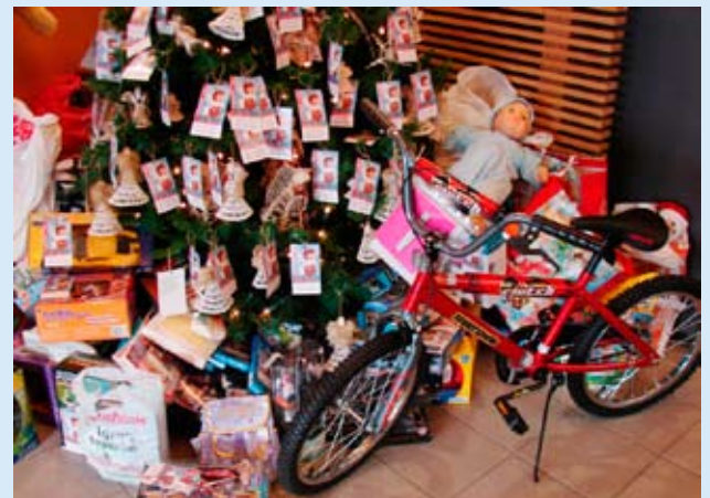
Angel Tree gift donations raised through Auto Workers Community Credit Union