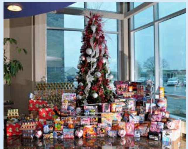
The Out in the Cold Program supported by Windsor Family Savings & Credit Union.