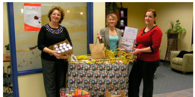
Unigasco Credit Union Food Drive