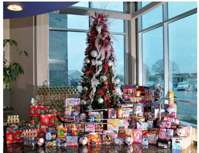
The Out in the Cold Program supported by Windsor Family Savings & Credit Union.