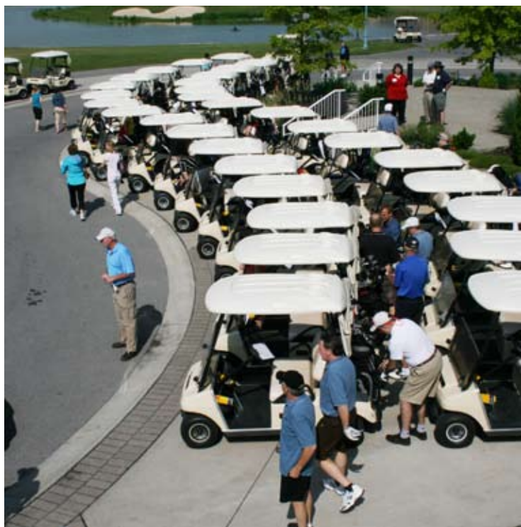
Ladies and Gentlemen, start your engines...

We are pleased to announce the net result of $59,200 raised from our 2008 Golf Tournament . Over the last 13 years we have been privileged to partner with CUMIS Insurance as the major event benefactor of our annual golf tournament. During this time we raised $750,000 to benefit Ontario credit union communities.