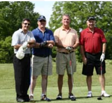
Best looking 4sum?

Cataract Savings, CGI, CUMA, De La Rue Cash Systems, Doxim, Dunnville & District Credit Union, Gemsys Money Handling Systems, Intria Items, IBM, Perception Web Management, Prime Financial Savings and Credit Union, Prosperity One, Smart Solution/Zetetic Data, Stewart Title Guaranty Company, Targus, Thamesville Credit Union, The Co-operators Group, Title Plus Lawyers Professional, Twin Oaks Credit Union